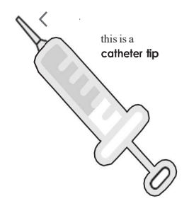
oral syringe with catheter tip (10mL, may require smaller syringe for dosing)