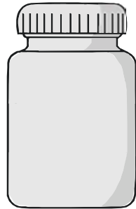
empty bottle with cap (50-100 mL recommended)