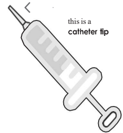
oral syringe with catheter tip (10mL, may require smaller syringe for dosing)