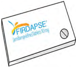
your FIRDAPSE tablets

You can get these supplies at your local pharmacy.